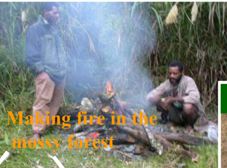
Making fire in the mossy forest