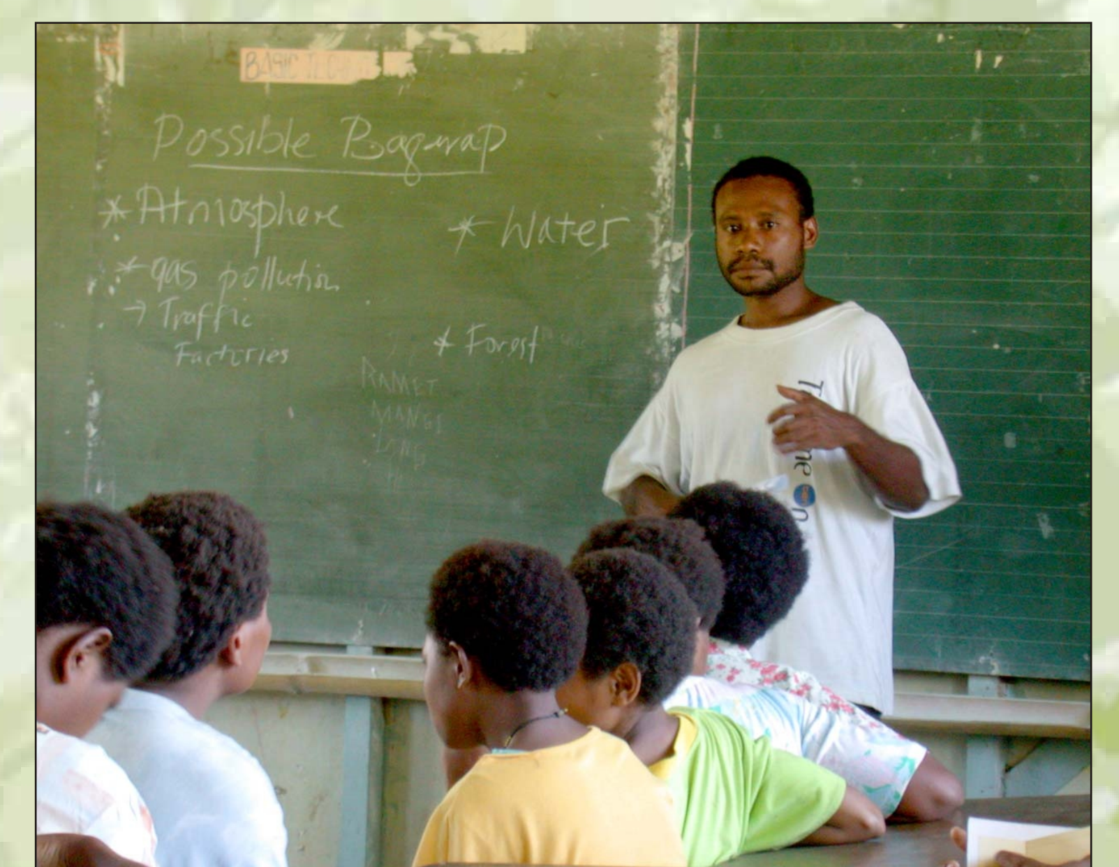
Fig. 4: Parataxonomists raise the environmental awareness of young generation.

Center's ultimate goals go beyond the carrying out scientific projects. The other, and by no means less important, is to pass our knowledge on other local people, on landowners, on school children. By producing dozens of educational leaflets, performing lectures in schools and educating grassroots audience in villages, we keep on raising the so necessary environmental awareness of the nation. (Fig.4)