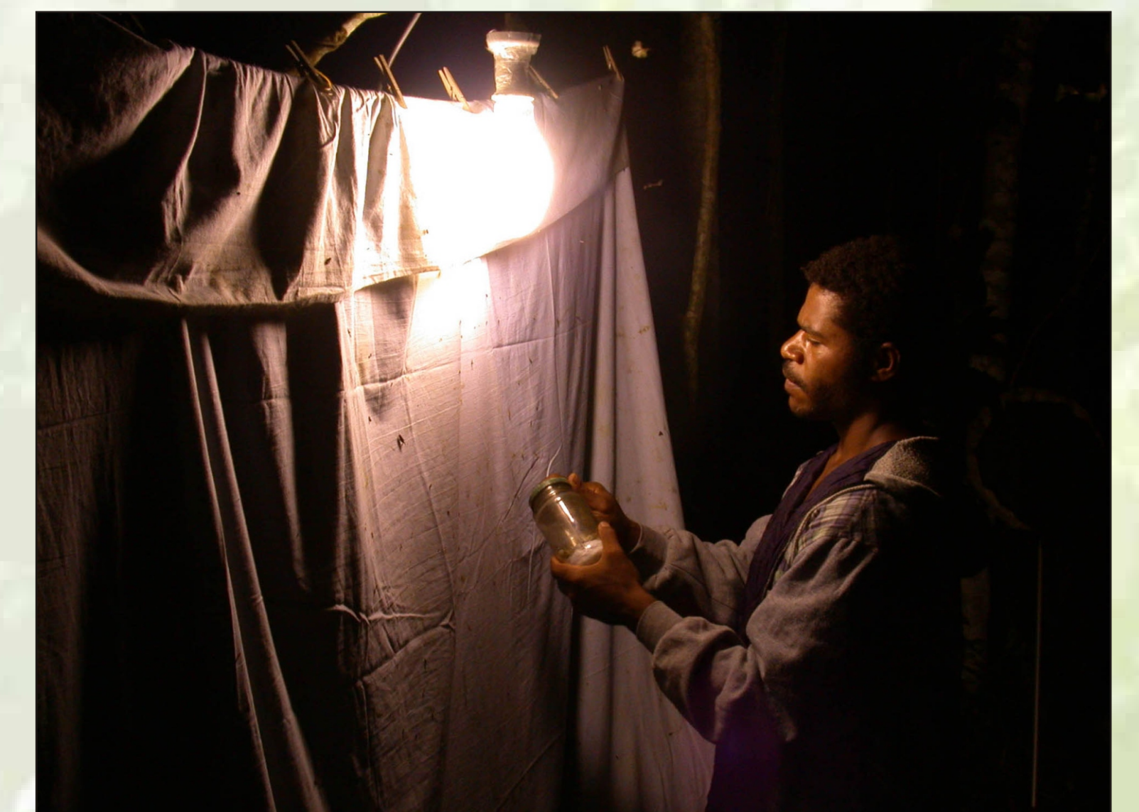
Fig. 1: Lighttrap - fieldwork is the first step.

The prefix "para" in this context modifies the meaning of the word "taxonomist" to nonprofessional scientific assistant, with rather limited access to standard expert facilities, but yet largely independent and able to solve complex scientific tasks. In the Parataxonomist Training Center, we are trained to use scientific tools, to perform various research activities and to understand broad context of scientific work.