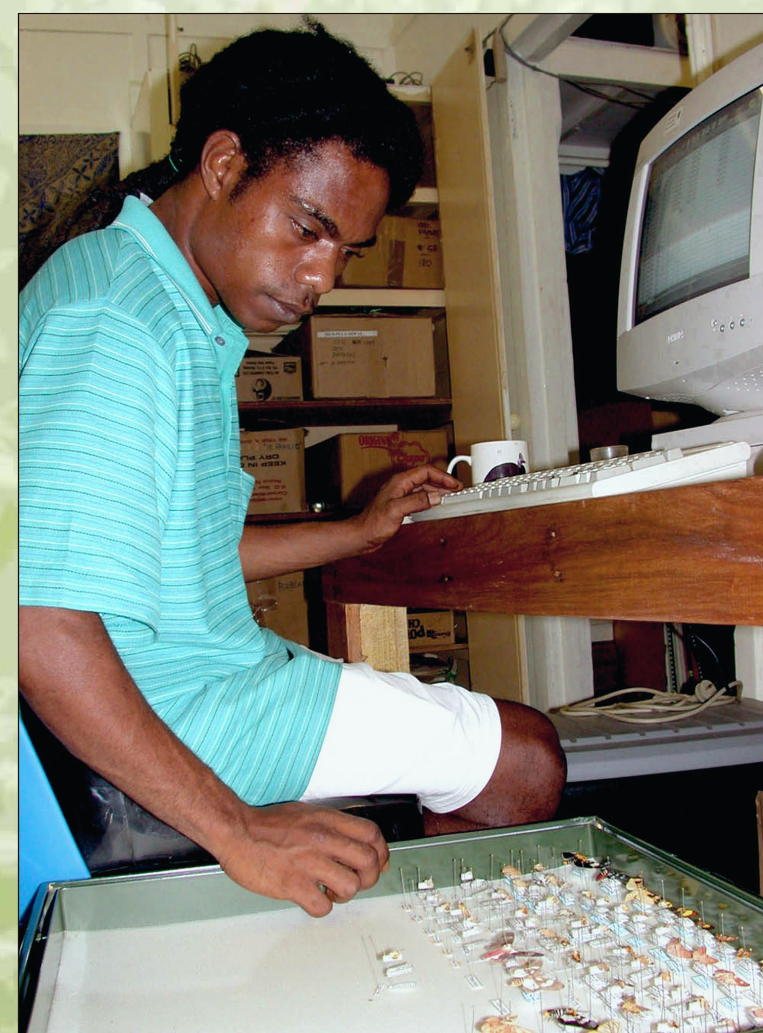
Fig. 5: Maintaining the database and reference collection.

This database is a backbone of the Centrum research activities. It's a still growing compendium of observations accumulated over five years of continuous extensive investigations. (Fig. 2) It contains data on various insect orders (for example, 42,000 records of Lepidoptera ), plants and fruits as well as their mutual relationships, digital images, development stages etc. We also maintain the collections of plant and insect material as a reference material for the database (fig. 3, 5).