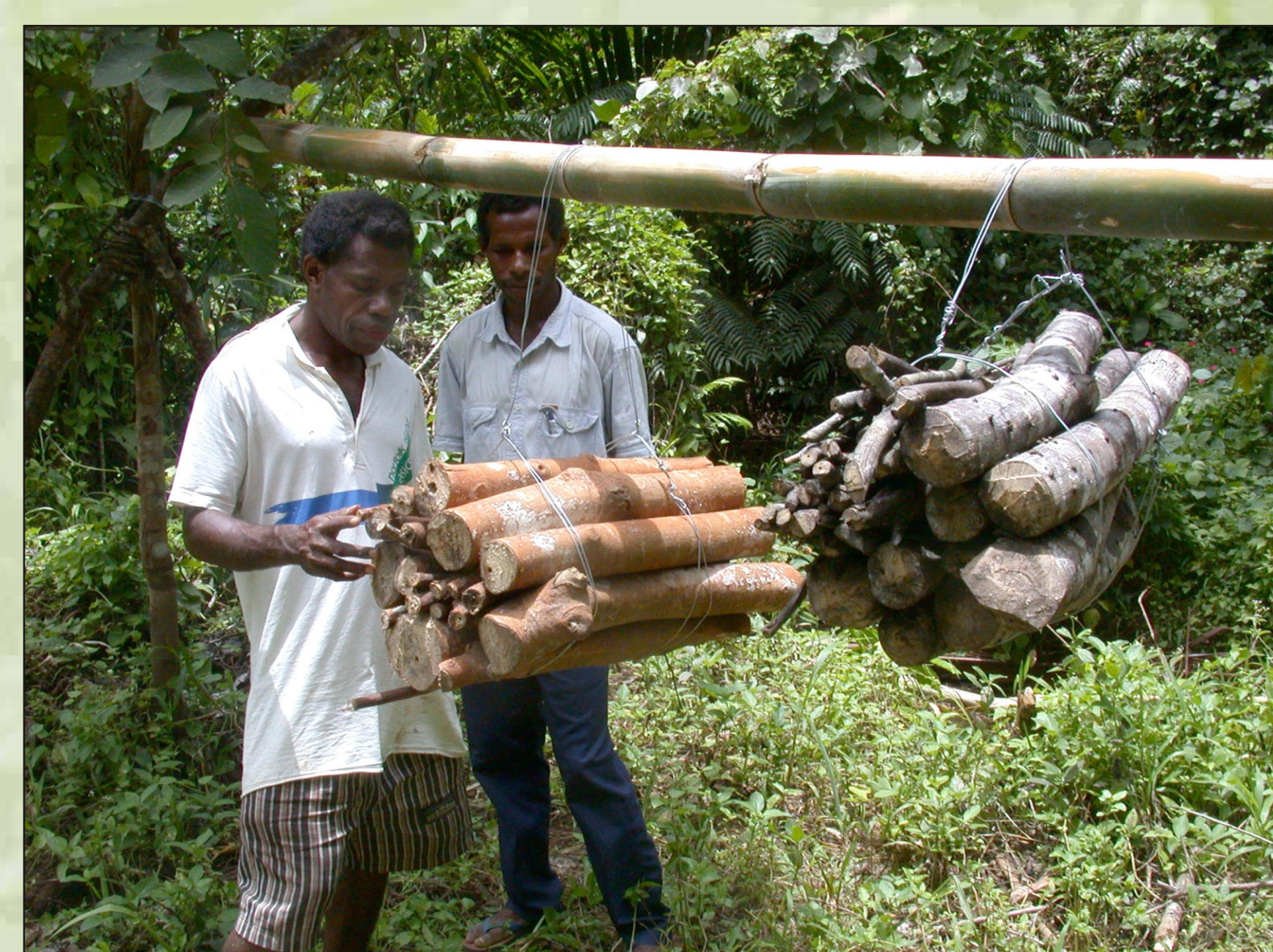
Fig. 6: Freshly cut logs are exposed in the forest to attract long-horned beetles ( Cerambycidae ).