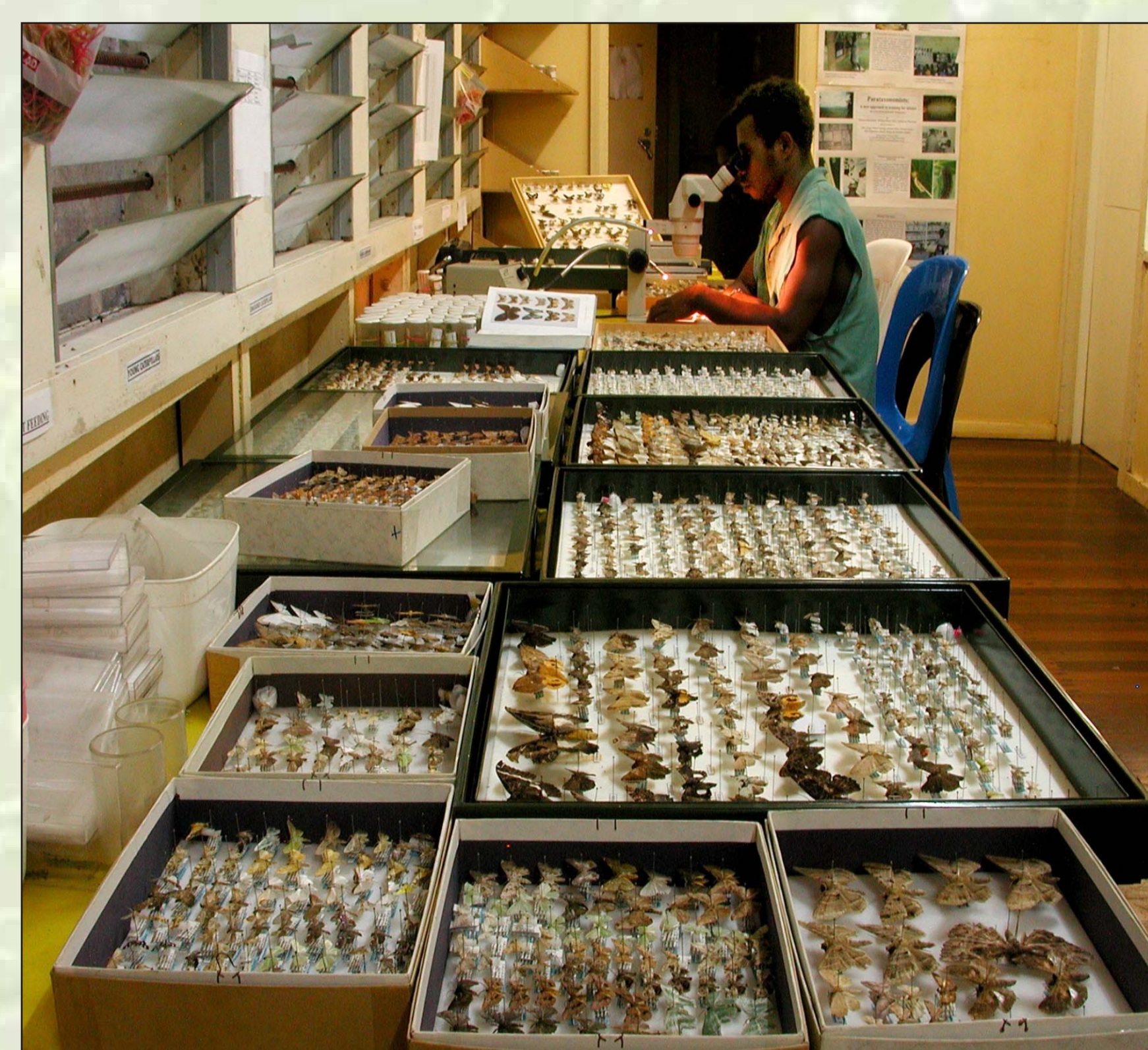
Fig. 3: To build our reference collection demanded to acquire considerable taxonomical skills.