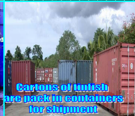
Cartons of tinfish are pack in containers for shipment