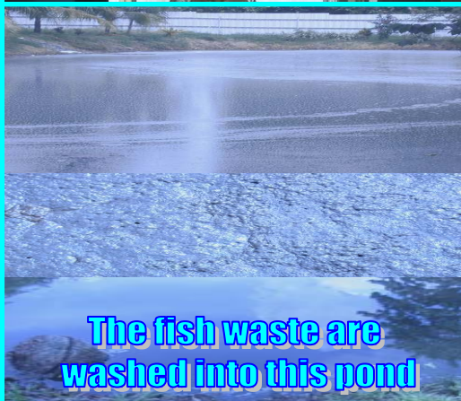
The fish waste are washed into this pond