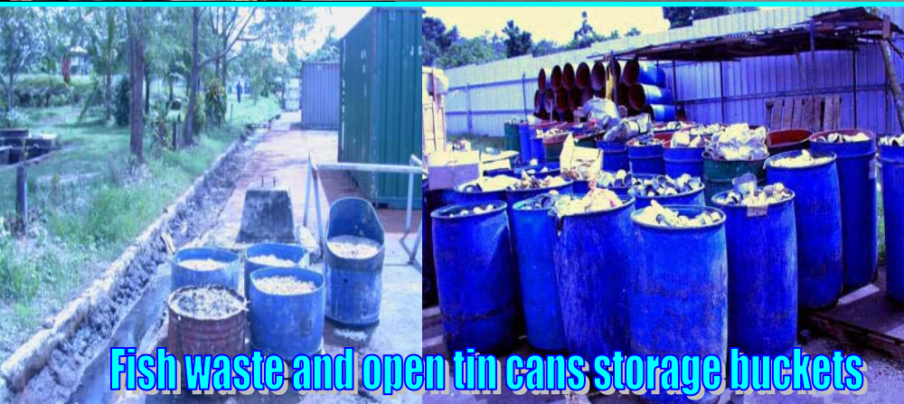
Fish waste and open tin cans storage buckets